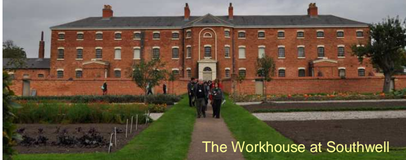
The Workhouse at Southwell

In October, the Poverty Convention was held in the evocative historic setting of The Workhouse. 180 people got together to share their experience of, and views on, poverty and social exclusion in the East Midlands.