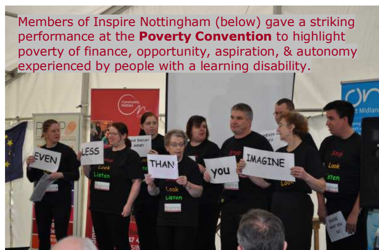
Members of Inspire Nottingham (below) gave a striking performance at the Poverty Convention to highlight poverty of finance, opportunity, aspiration, & autonomy experienced by people with a learning disability.

Finally, in a period when unemployment seems set to rise and new jobs created at a slower rate than expected, there are not enough jobs to support a work solution. Financial incentives to move towards work without compromising benefit are welcomed, filling in the poverty trap, providing the overall level of benefit isn't driven down.